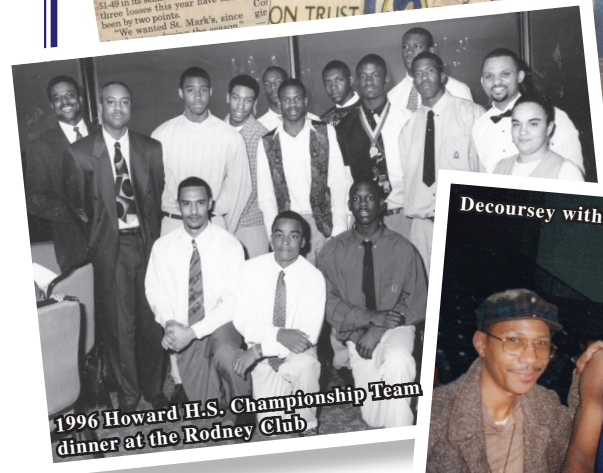
1996 Howard H.S. Championship Team dinner at the Rodney Club